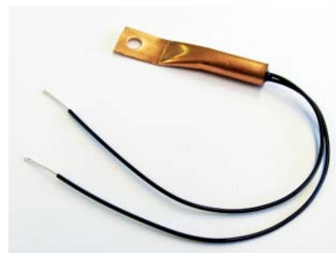
Figure 1.4.-1 SAS-10 Sensor

The function switch on the right side of the controller should be set in the center, 'AUTO', position for automatic pump control. When the switch is in the 'ON' position, Relay 1 will be on continuously, regardless of temperature difference. With the switch in the 'OFF' position, Relay 1 will remain off.